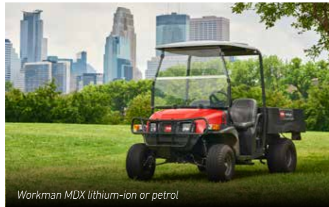
Workman MDX lithium-ion or petrol