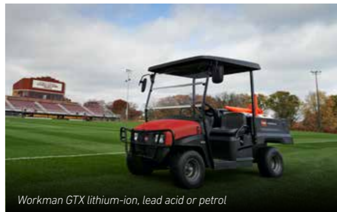
Workman GTX lithium-ion, lead acid or petrol