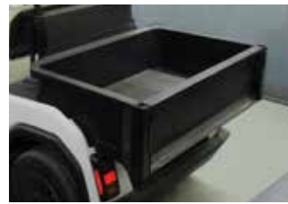
Cargo bed (light duty)