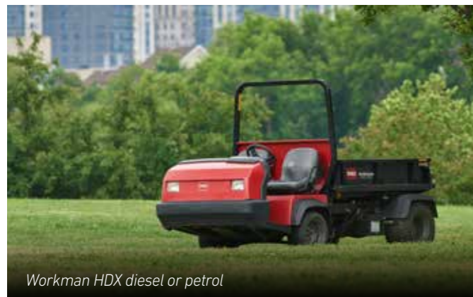
Workman HDX diesel or petrol