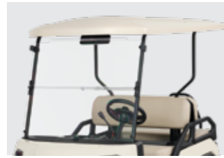
Canopy – 4, 6 and 8-seat (required on 4-seat models)

Vista has several accessories available to enhance its use and function, including an optional canopy for weather protection, and a folding windscreen to help block wind and debris. These and other attachments contribute to a safe and enjoyable experience.