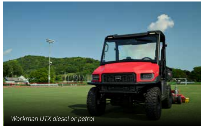
Workman UTX diesel or petrol

Sometimes a job requires more grit than grace. From hauling heavy loads to transporting vital work crews, Toro is proud to provide a full line of vehicles to meet any need. For more rugged tasks, there is no better option than Toro's Workman utility vehicles. A top choice for grounds professionals, Workman utility vehicles offer exceptional reliability, power and high payloads.